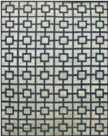
Nixon* - Denim