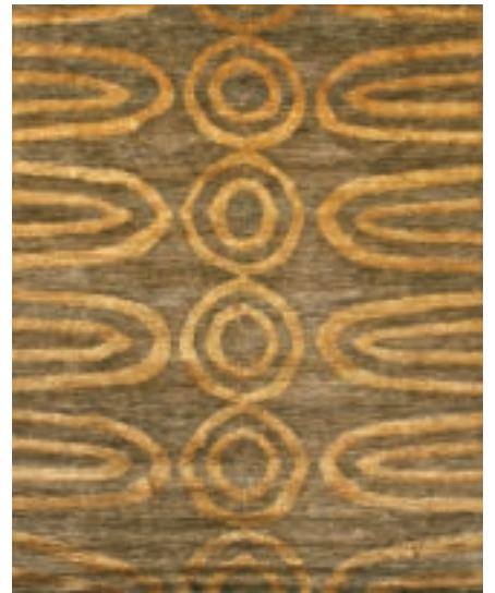
Vertebrae - Orange