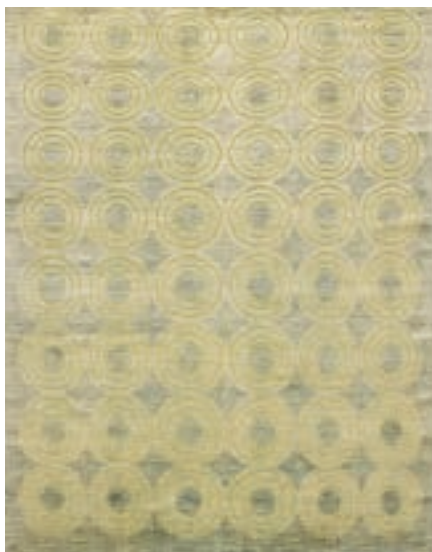
Oculus* - Gray