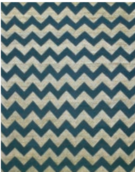
Jagged* - Denim