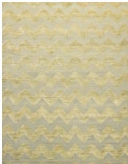
Jagged* - Natural