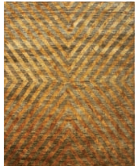
Bridget - Orange