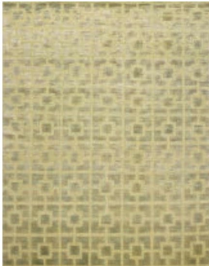
Nixon* - Ice