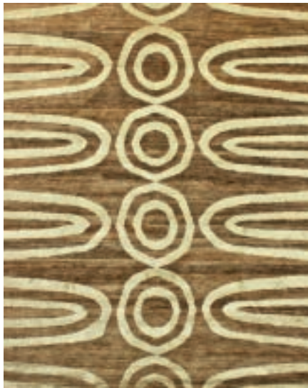
Vertebrae - Brown