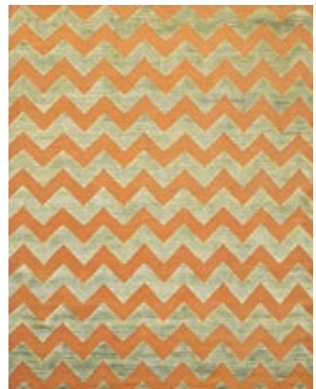
Jagged* - Orange

Due to hand made construction and fiber's natural variations, carpet is not guaranteed to match photographic representation