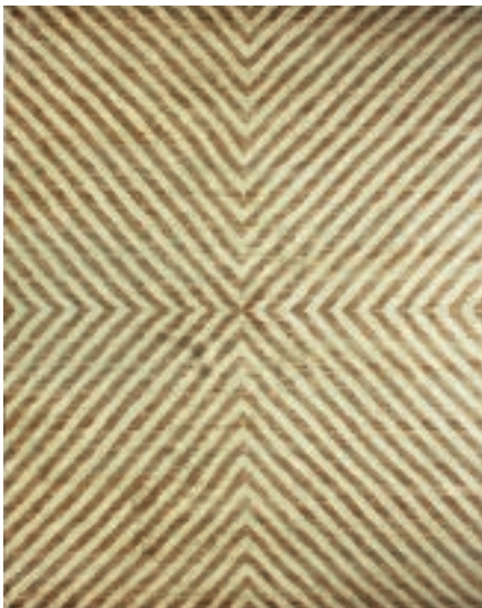
Bridget - Brown

Jonathan Adler's first carpet collection for Kravet Carpet includes a beautiful and unique selection of in stock area rugs offered in simple and sophisticated geometric designs. These designs are available in two styles. One is a hand-knotted cut pile wool area rug that is dyed by hand using vegetable and chrome dyes, resulting in natural irregularities for a one-of-a-kind antiqued look that adds depth and a strong gradation of color. The second available construction is hand-knotted using undyed natural hemp and bamboo silk, which features a beautiful tiger's eye striation and amplifies the beauty of the fibers. These natural color variations, weave lines and striations add to the beauty of these simple and striking designs. All rugs are available in stock in a range of sizes, making them ideal for any timeline and budget.