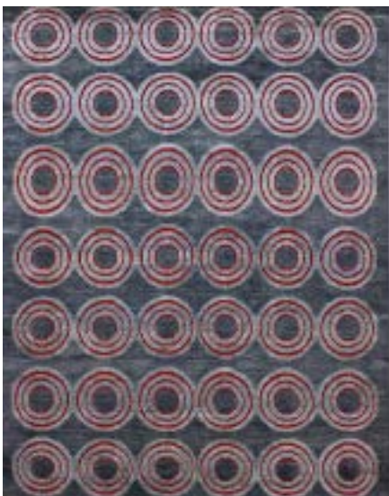
Oculus* - Slate