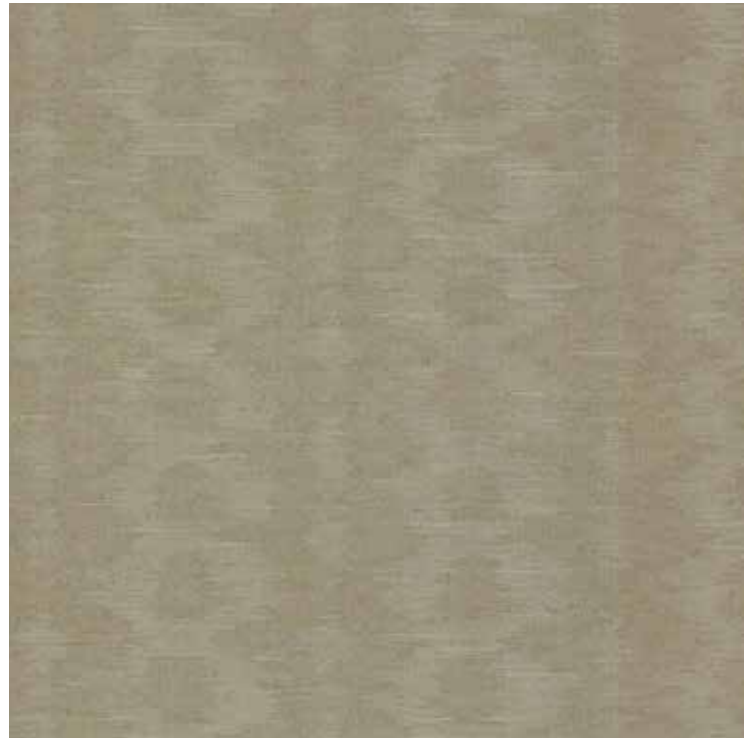
MONTAGU • STONE 2015143-11

ALSO AVAILABLE • IVORY/BARK (68), IVORY/BEIGE (16), IVORY/CHAMBRAY (115), OYSTER/SAPPHIRE (50), GREEN/BEIGE (30), RED/BEIGE (19)