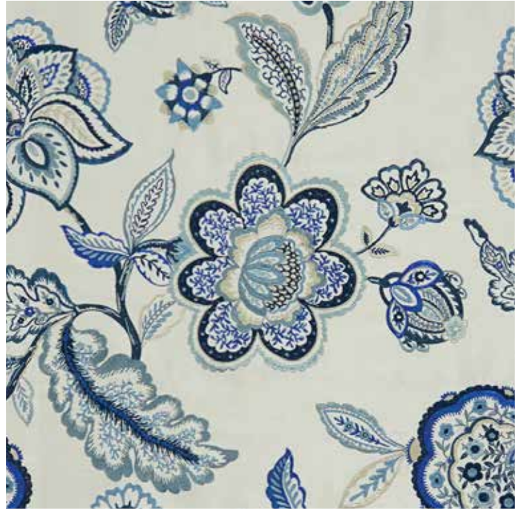
FLORES • DUSK/BLUE 2015144-515

ALSO AVAILABLE • OYSTER (101), PEWTER (11), MERLOT (910), LAGOON (135), CELADON (123), LEAF (3)