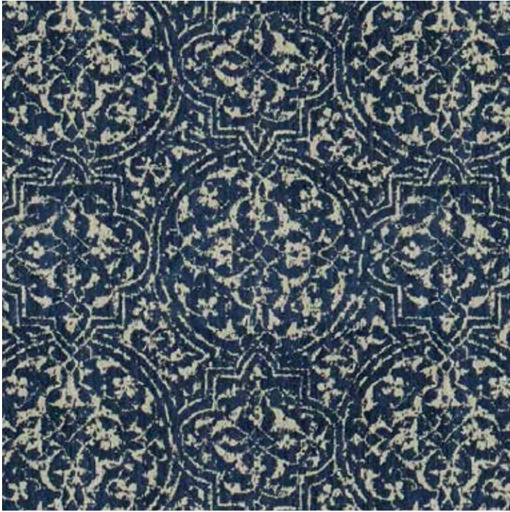
BROGLIE • BLUE 2015126-5

ALSO AVAILABLE • OYSTER (101), PEWTER (11), MERLOT (910), LAGOON (135), CELADON (123), LEAF (3)