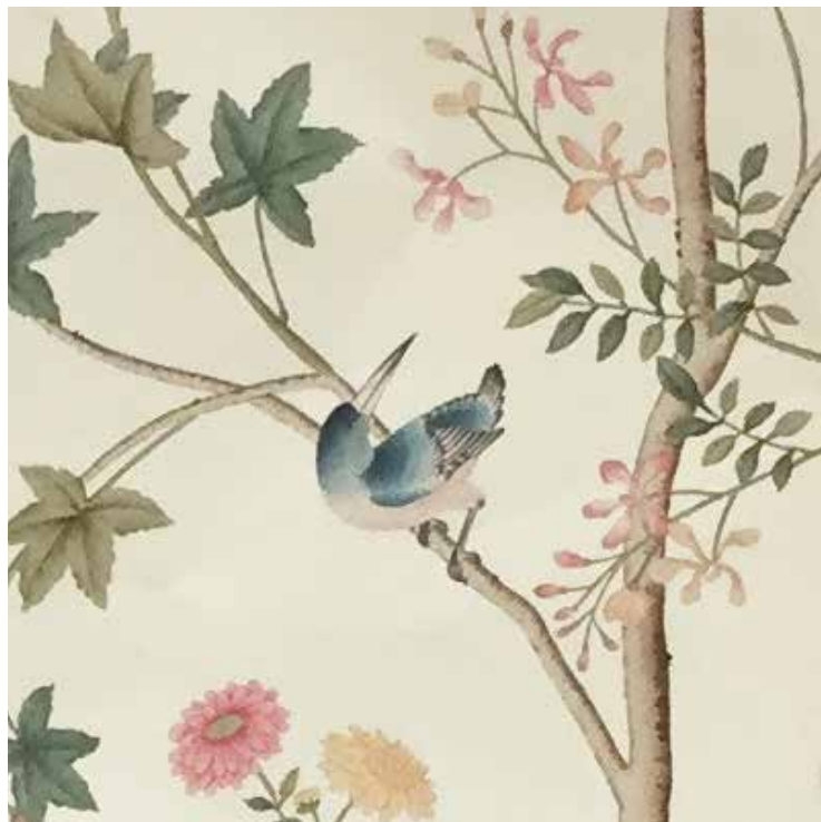
BEAUJEU • MULTI 2016119-735

ALSO AVAILABLE • IVORY/BEIGE (116), IVORY/LAKE (113), SAGE/SISAL (323)