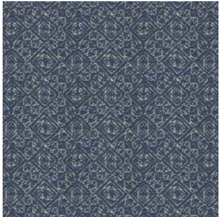
SUMBA • BLUE 2015127-5

ALSO AVAILABLE • BEIGE (16), MERLOT (910), LAKE (13), NAVY (5), GREEN (30), BROWN (68)