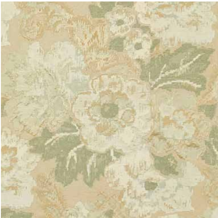
PONTHEIU • SAGE/BIRCH 2015146-113

ALSO AVAILABLE • BARLEY (116), LAGOON (13)