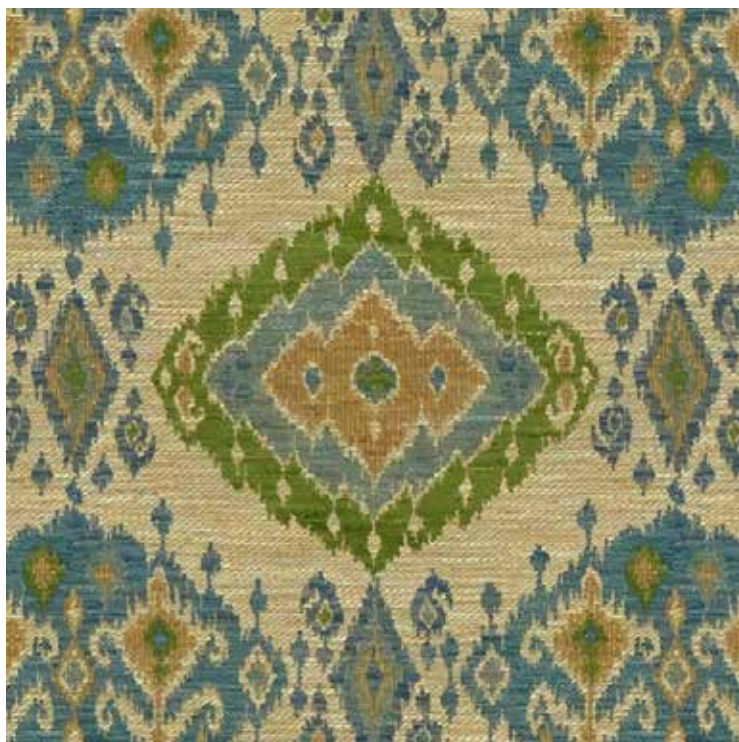
BOSHAM • TEAL/GREEN 2015125-313

ALSO AVAILABLE • GREY (11), PETAL/JADE (175) COMING SOON