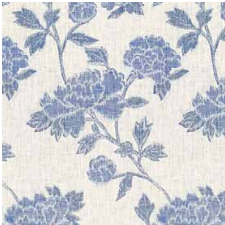
GRACIELA • IVORY/BLUE 2015147-115

ALSO AVAILABLE • IVORY/BEIGE (116), IVORY/LAKE (113), SAGE/SISAL (323)