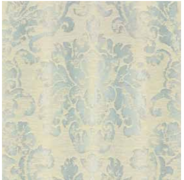
WESSEX • AQUA 2015145-13

ALSO AVAILABLE • OYSTER (116), TAUPE (11)