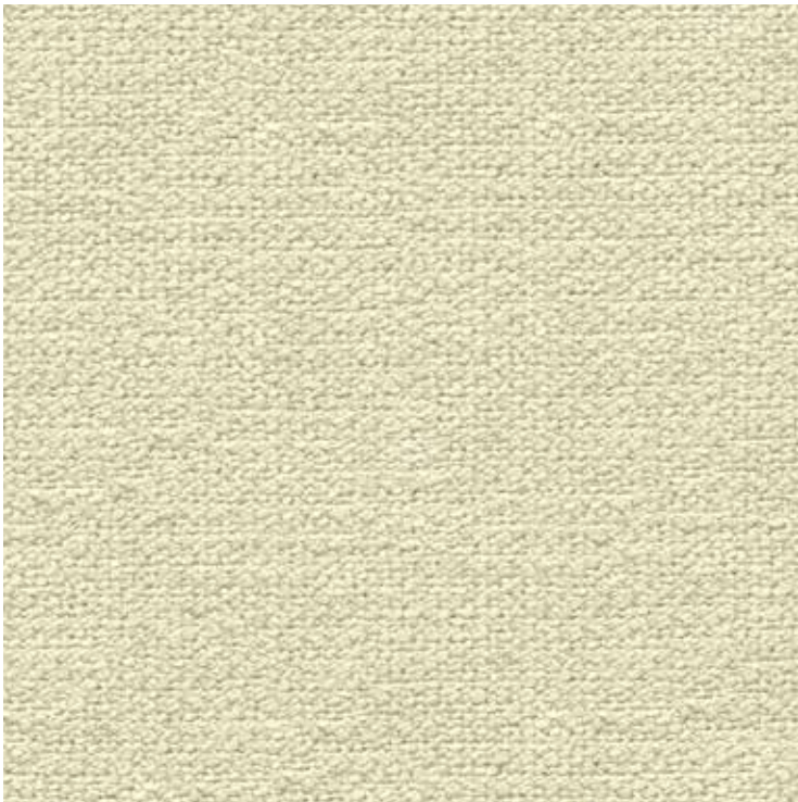
JOPU • SAND 2015141-16

ALSO AVAILABLE • OPAL/PETAL (722), RED/BLUE (945), BLUE/GOLD (543)