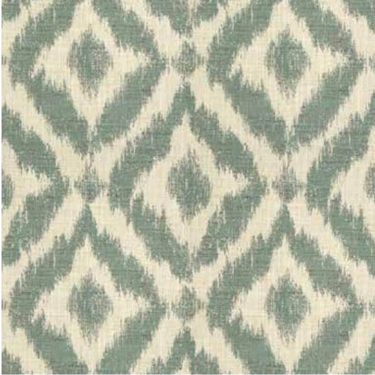
LYRA • OYSTER/AQUA 2015142-13

ALSO AVAILABLE • IVORY/BARK (68), IVORY/BEIGE (16), IVORY/CHAMBRAY (115), OYSTER/SAPPHIRE (50), GREEN/BEIGE (30), RED/BEIGE (19)