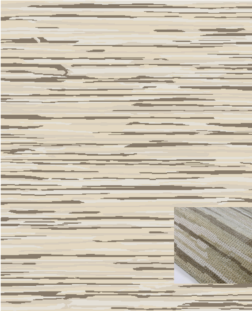
8'x10' CAD Rendering