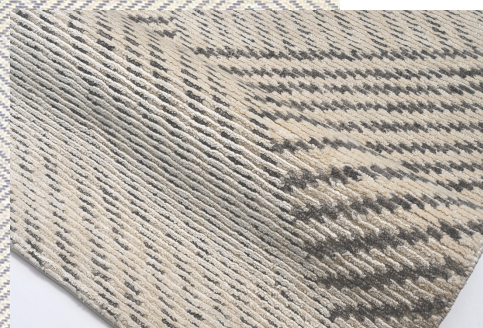
8'x10' CAD Rendering