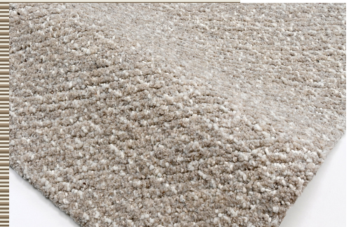
8'x10' CAD Rendering