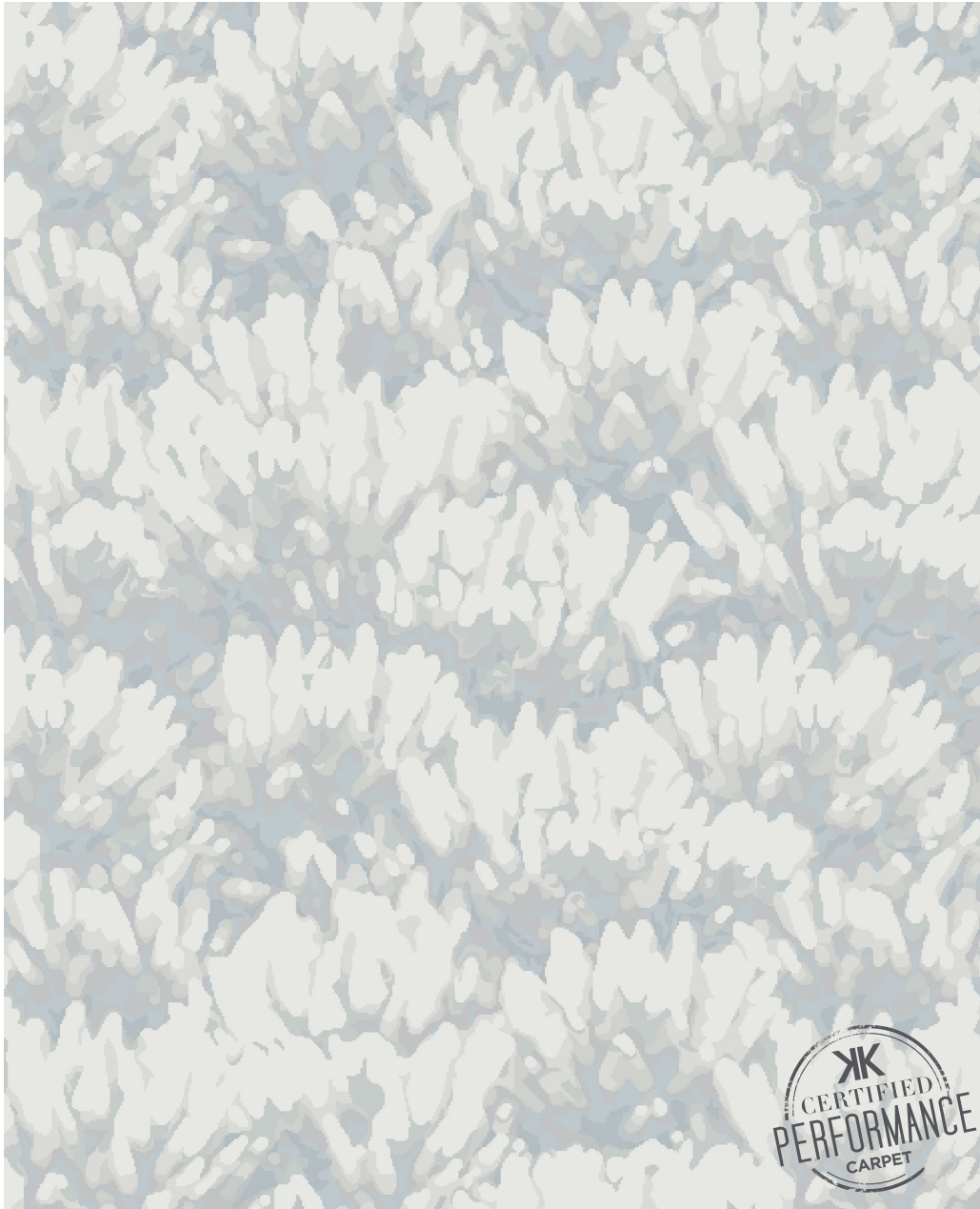
8'x10' Digital Rendering