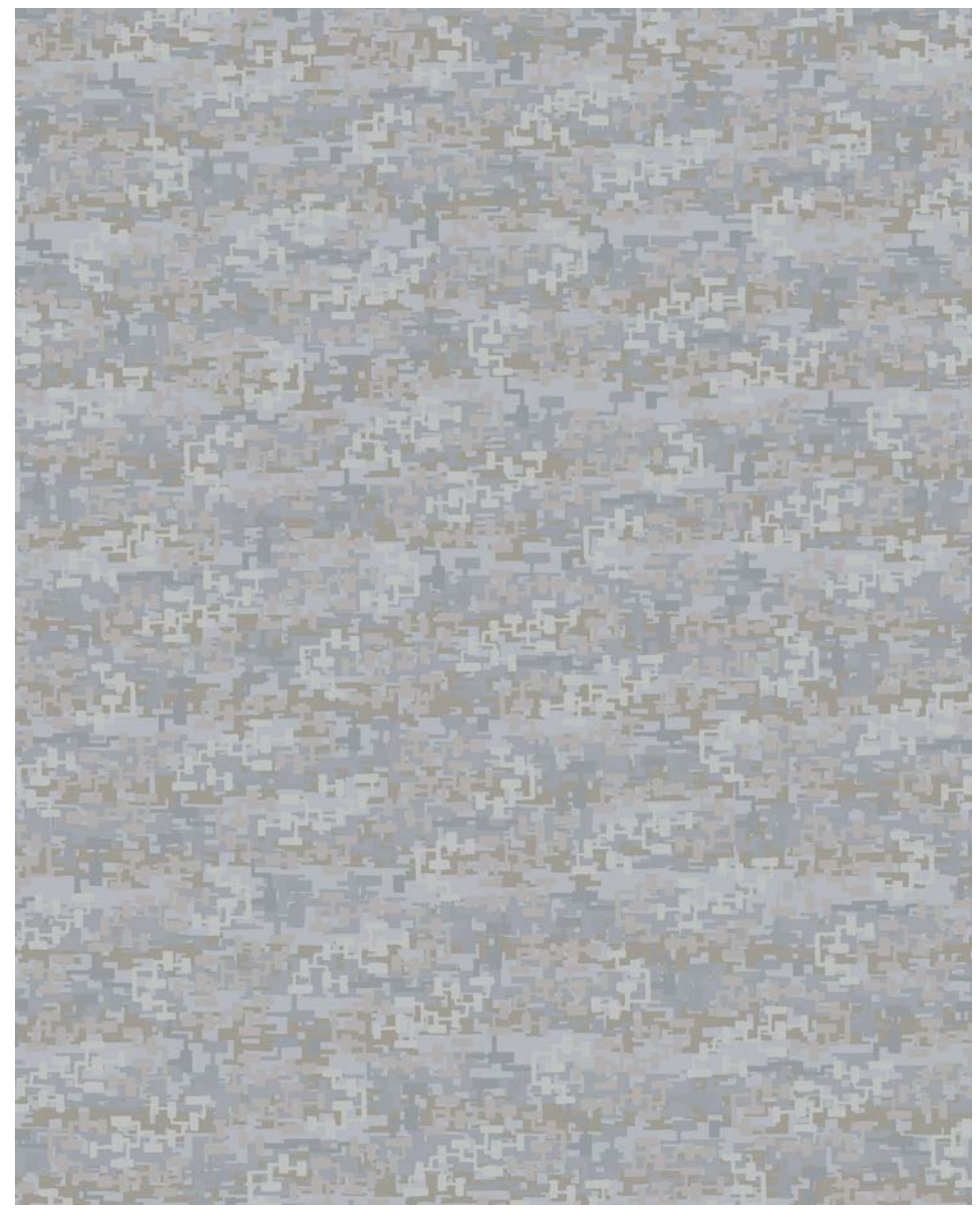
This is a digital representation of an 8x10