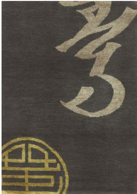
TAIKO - CHOCOLATE BASE COLOR · KW142 DESIGN COLORS · KS104, KS19

IMAGE IS A DIGITAL REPRESENTATION OF THE ACTUAL CARPET. COLORS MAY VARY.