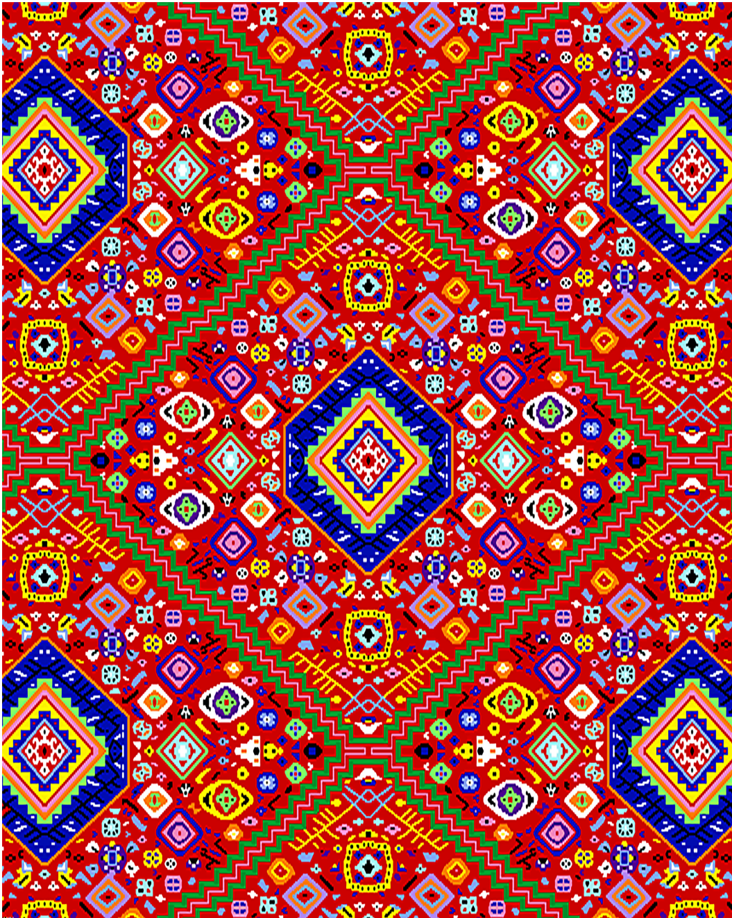
This is a digital, hi-contrast rendering of an 8'x10' area rug