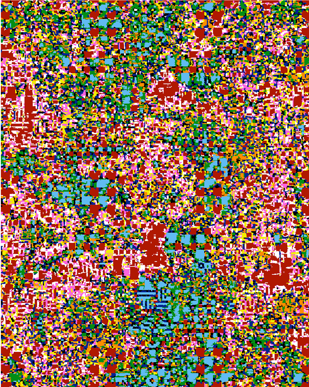
This is a digital, hi-contrast rendering of an 8'x10' area rug