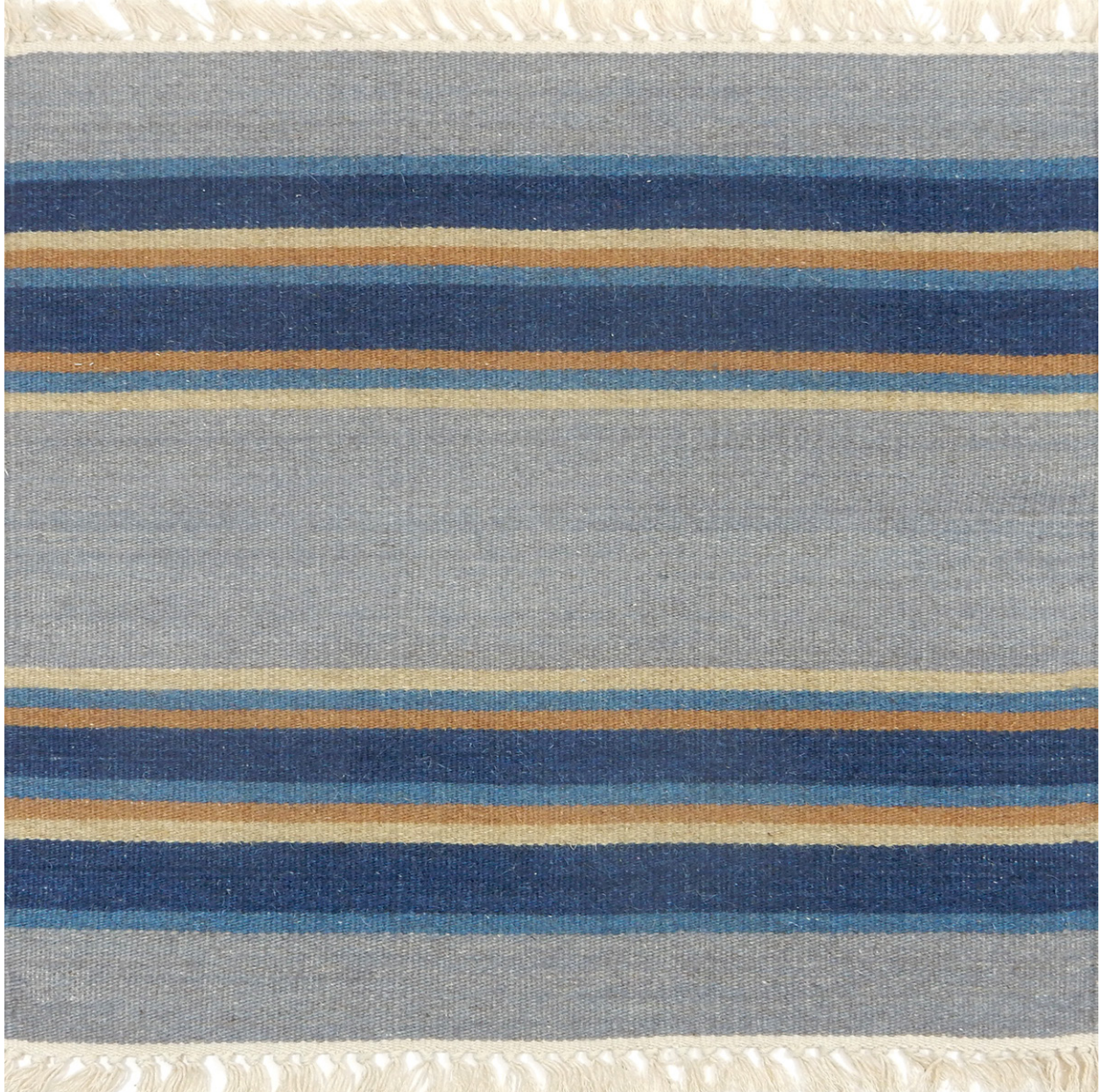
LENBROOK - COASTLINE