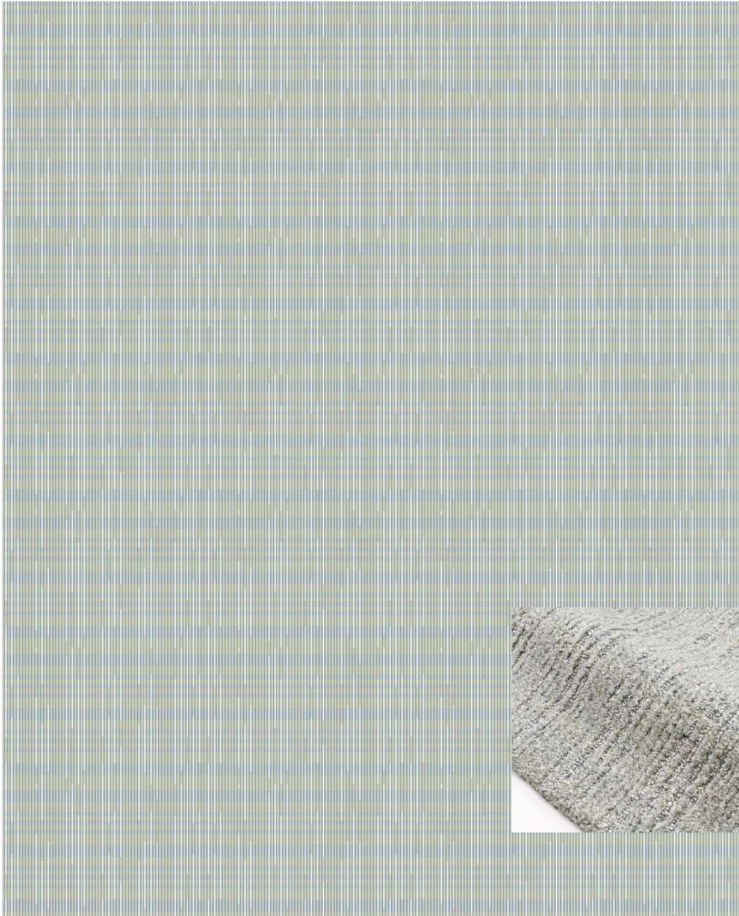
8'x10' CAD Rendering