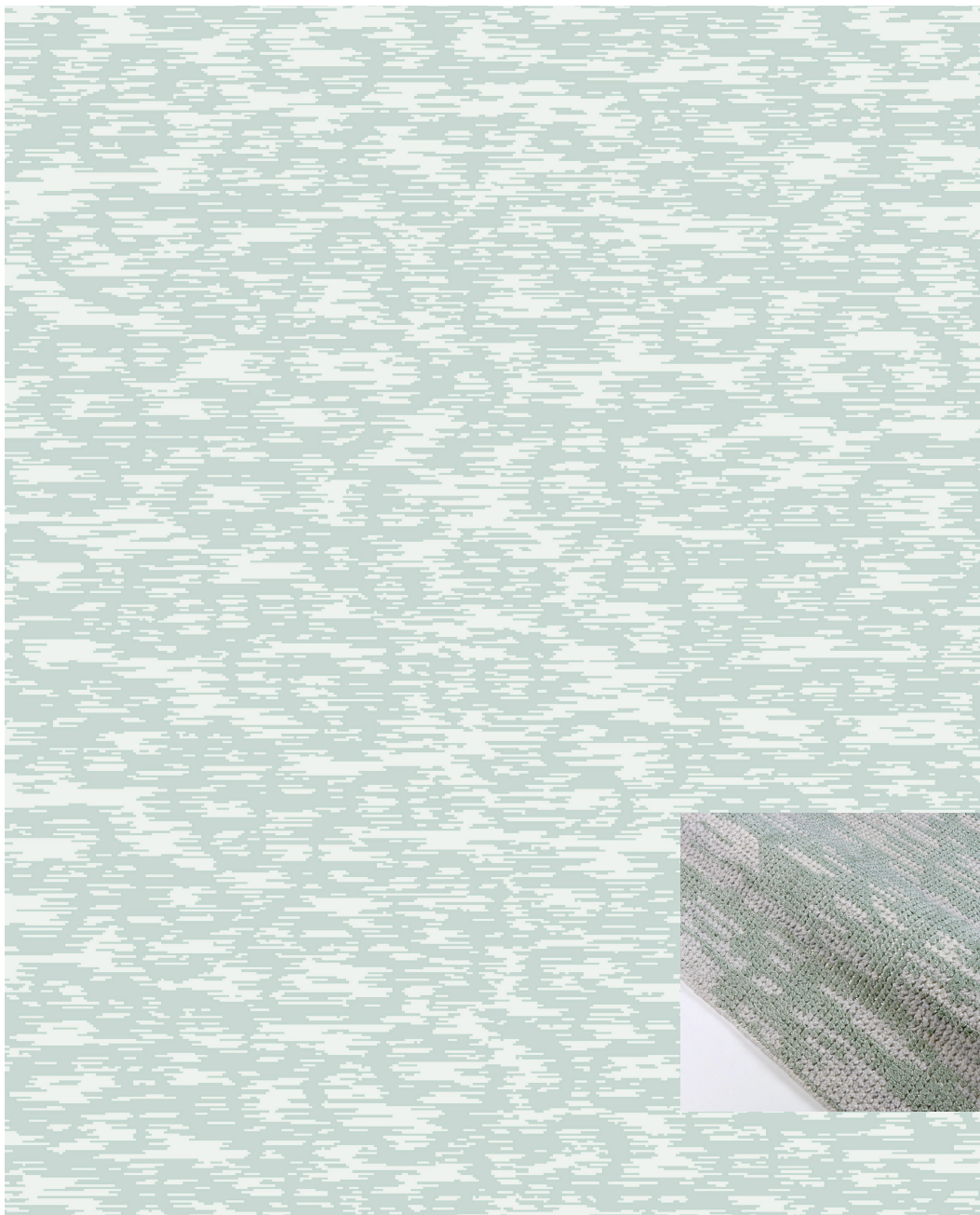
8'x10' CAD Rendering