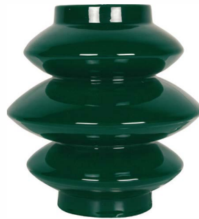
CHESTER 12.5"H x 11"W (OPTIONAL BASE IS 6"DIA x 1"H)