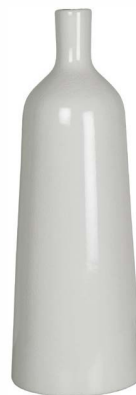
HAVEN 16"H x 6"W (OPTIONAL BASE IS 6"DIA x 1"H)