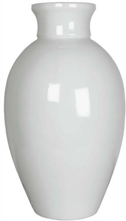
JUDE 20"H x 10.5"W (OPTIONAL BASE IS 8"DIA x 1"H)