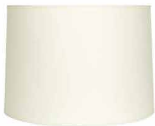
PARCHMENT DRUM (SIZES VARY BY LAMP BODY STYLE)

Either of these classic cream parchment shapes are perfectly scaled for each lamp. No shade needed? No problem. All lamps are available without shades.