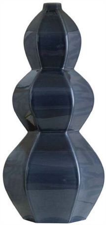
HALLIE 21.5"H x 9.5"W (OPTIONAL BASE IS 7"DIA x 1"H)

Varying in scale and style, these ceramic silhouettes set the foundation to create the perfect lamp to suit any interior.