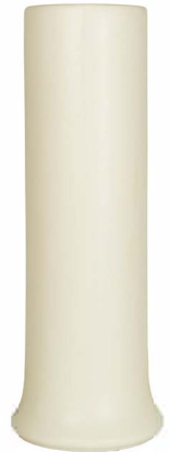
BAKER 18"H x 6.5"W (OPTIONAL BASE IS 7"DIA x 1"H)