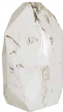
NASH 15"H x 10"W (OPTIONAL BASE IS 7"DIA x 1"H)