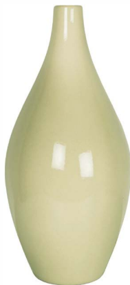
EVERLY 17"H x 8"W (OPTIONAL BASE IS 5"DIA x 1"H)