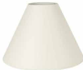
PARCHMENT CONE (SIZES VARY BY LAMP BODY STYLE)