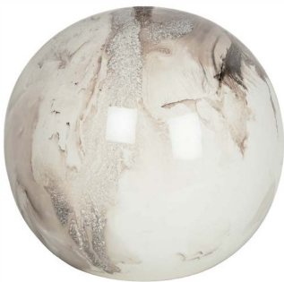
MORGAN 13"H x 12"W (OPTIONAL BASE IS 6"DIA x 1"H)