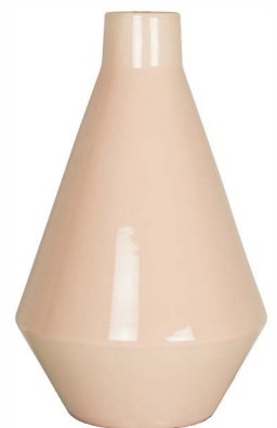
CLOVER 15"H x 9.25"W (OPTIONAL BASE IS 6"DIA x 1"H)