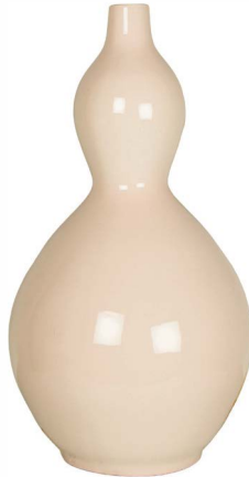
CORA 20"H x 10.25"W (OPTIONAL BASE IS 7"DIA x 1"H)