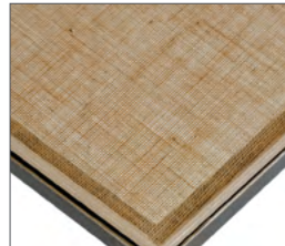
BURLAP LAMINATE GLASS