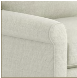
SS | SOCK ARM WITH SEAT CUSHION TO FRONT* 6"OW