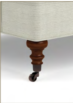
ENGLISH LEG 3"OW x 6.25"OH