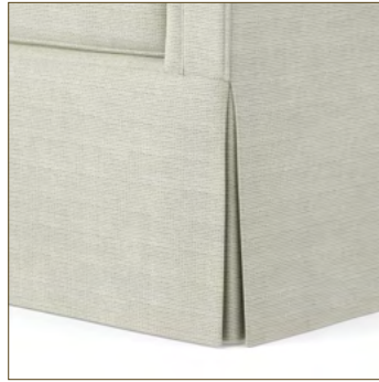
DSW | WATERFALL SKIRT SEAT TO FRONT 12.5" FRONT OH