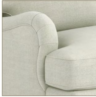
ET | ENGLISH ARM WITH T SEAT CUSHION 4.5"OW