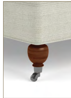
TRADITIONAL LEG 3"OW x 6"OH