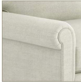
LS | PANEL ARM WITH SEAT CUSHION TO FRONT* 6"OW