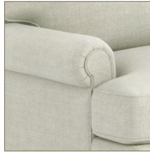
LT | PANEL ARM WITH T SEAT CUSHION 6"OW