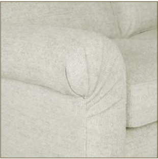
LPN | LARGE PLEATED ARM WITH SEAT CUSHION TO FRONT* 8"OW