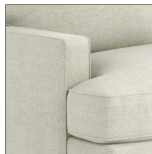
TT5 | 5" TRACK ARM WITH T SEAT CUSHION 5"OW

Arm height is 25.5" for all except English Arm - 24" Tapered Arm and all Track Arms - 24.5"