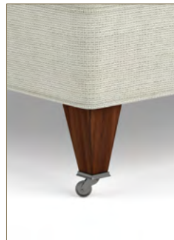
TAPERED LEG 2.5"OW x 6.25"OH