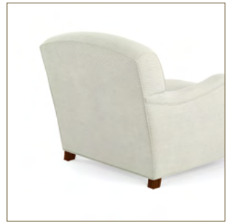
SR | ROLLED TIGHT BACK / T CUSHION* Not available on Sectional