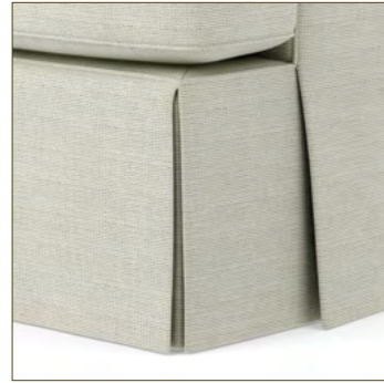
DSW | WATERFALL SKIRT T CUSHION 12.5" FRONT OH