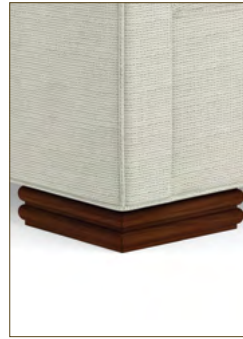
RIBBED BLOCK LEG 7"OW x 2"OH RB