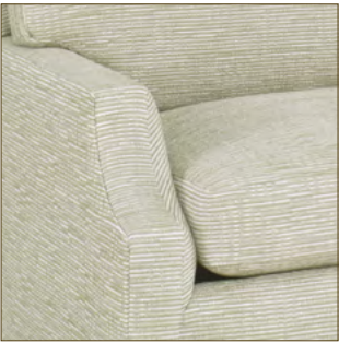
SA | SLOPED TRACK ARM WITH SEAT CUSHION TO FRONT* 3.5"OW