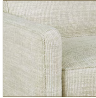
HE | TAPERED WITH SEAT CUSHION TO FRONT* BS Back only Swivel Glider not available 2.5"OW