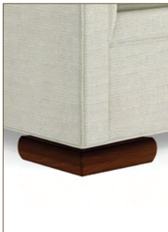
PLAIN BLOCK LEG 7"OW x 2"OH BULLNOSE BP