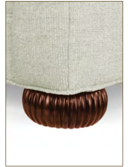
REEDED BUN LEG 7"OW x 3.5"OH BR