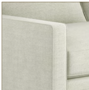
TF5 | 5" TRACK ARM WITH SEAT CUSHION TO FRONT* 5"OW