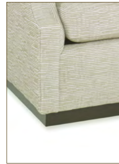
PLINTH BASE 2.5" OFF THE FLOOR, INSET 1" FROM EDGES PB*