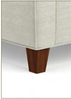
MODERN LEG 2.25"OW x 3.5"OH