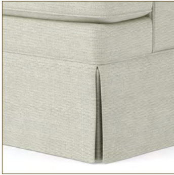
DSS | TALL DRESSMAKER SKIRT 9.5"OH