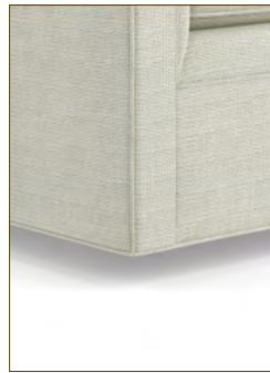
UPHOLSTERED BASE 2" OFF THE FLOOR BF