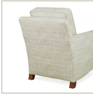
BS | BORDER EDGE BACK / STRAIGHT CUSHION