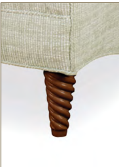
SPIRAL LEG 3.5"OW x 6.25"OH