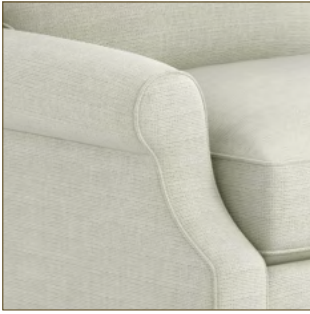
DS | SLOPED SOCK ARM WITH SEAT CUSHION TO FRONT* 6"OW