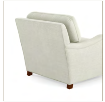
KE | KNIFE EDGE BACK / T CUSHION