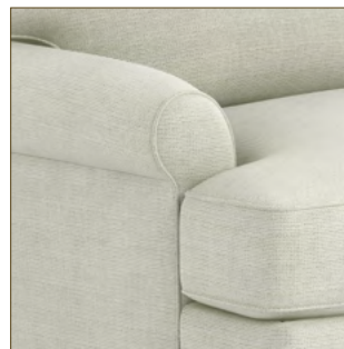
ST | SOCK ARM WITH T SEAT CUSHION 6"OW