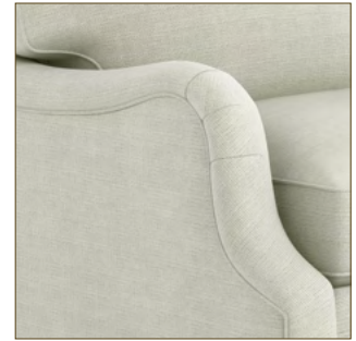
ME | MODIFIED ENGLISH ARM WITH SEAT CUSHION TO FRONT* 4.5"OW