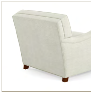
SB | BORDER EDGE TIGHT BACK / T CUSHION*