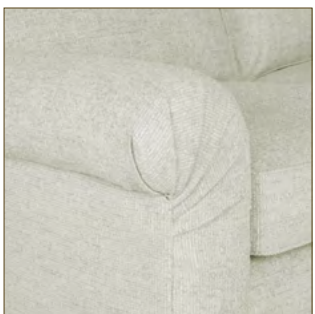
LPN | LARGE PLEATED ARM WITH SEAT CUSHION TO FRONT* 8"OW