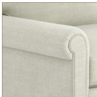
LS | PANEL ARM WITH SEAT CUSHION TO FRONT* 6"OW