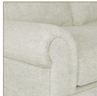
LPL | LARGE PANEL ARM WITH SEAT CUSHION TO FRONT* 8"OW