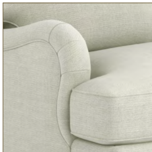
ET | ENGLISH ARM WITH T SEAT CUSHION 4.5"OW