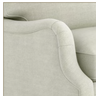
ME | MODIFIED ENGLISH ARM WITH SEAT CUSHION TO FRONT* 4.5"OW