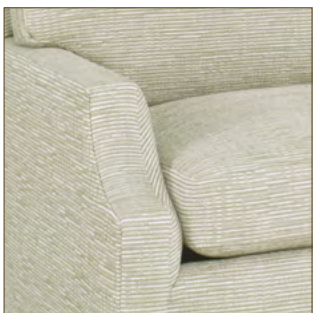
SA | SLOPED TRACK ARM WITH SEAT CUSHION TO FRONT* 3.5"OW