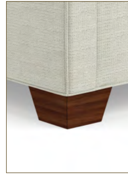
TAPERED BLOCK LEG 4"OW x 3.5"OH TB