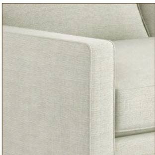
TF5 | 5" TRACK ARM WITH SEAT CUSHION TO FRONT* 5"OW