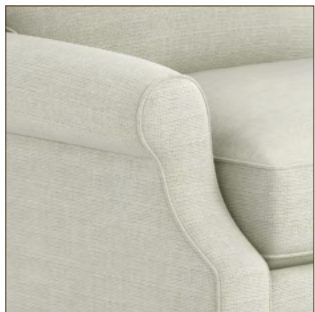
DS | SLOPED SOCK ARM WITH SEAT CUSHION TO FRONT* 6"OW