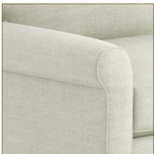
SS | SOCK ARM WITH SEAT CUSHION TO FRONT* 6"OW