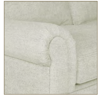
LPN | LARGE PANEL ARM WITH SEAT CUSHION TO FRONT* 8"OW