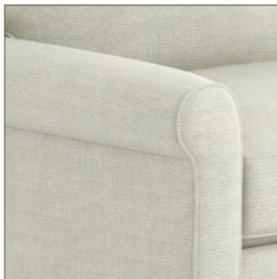
SS | SOCK ARM WITH SEAT CUSHION TO FRONT* 6"OW