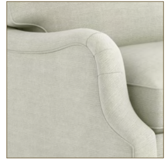
ME | MODIFIED ENGLISH ARM WITH SEAT CUSHION TO FRONT* 4.5"OW