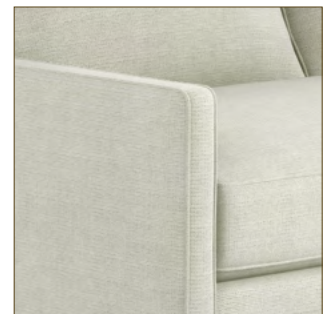
TF | 3" TRACK ARM WITH SEAT CUSHION TO FRONT* 3"OW