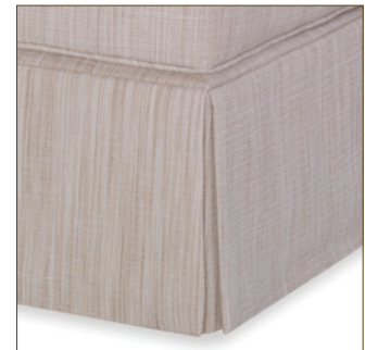
DSW | WATERFALL SKIRT 12.5"OH