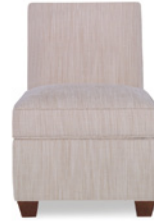
SLIPPER CHAIR • SWIVEL • CASTERS JF25 • JF25S* • JF25C*

OW = 23.5" OD/SD = 36"/22.5" OH/SH = 36"/20"