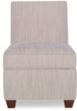
SLIPPER CHAIR • SWIVEL • CASTERS JF23 • JF23S* • JF23C*

OW = 23.5" OD/SD = 36"/22.5" OH/SH = 36"/20"