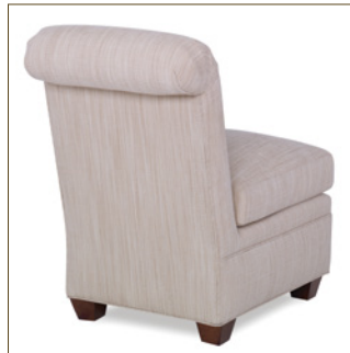
TR | TIGHT ROLLED BACK