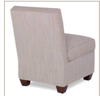
TS | TIGHT SQUARE BACK