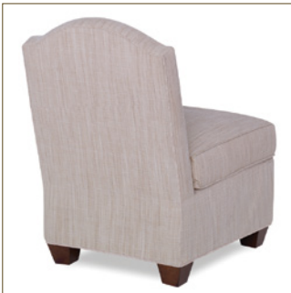
TN | TIGHT NOTCHED BACK