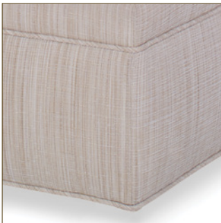
BF | UPHOLSTERED BASE 2" OFF THE FLOOR