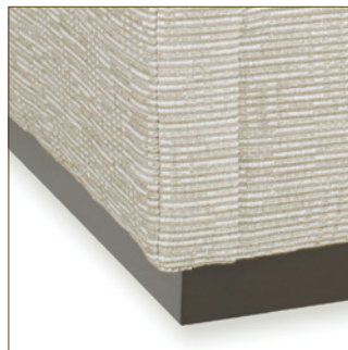
PB | PLINTH BASE 2.5" OFF THE FLOOR, INSET 1" FROM EDGES