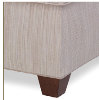
TB | TAPERED BLOCK LEG 4"OW x 3.5"OH