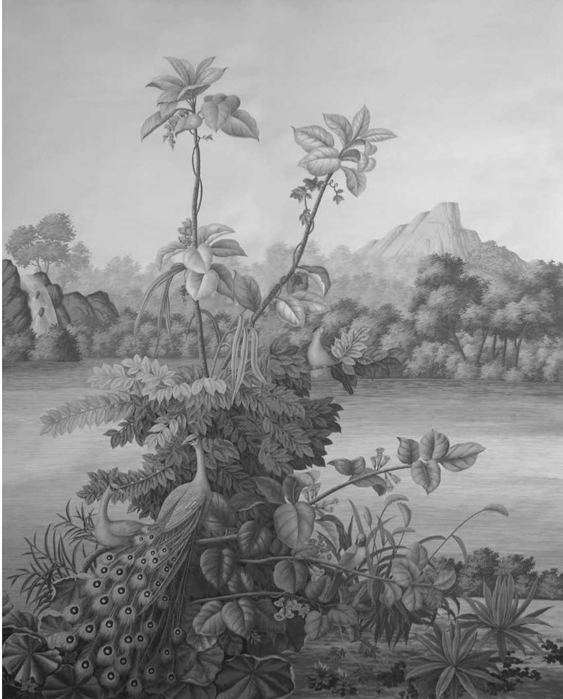
THE PAINTED CHAMBER P8014706